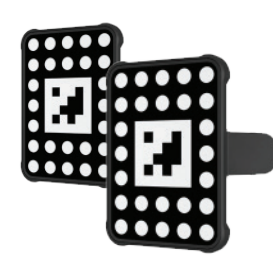
Two Targets Use During ADAS Calibration